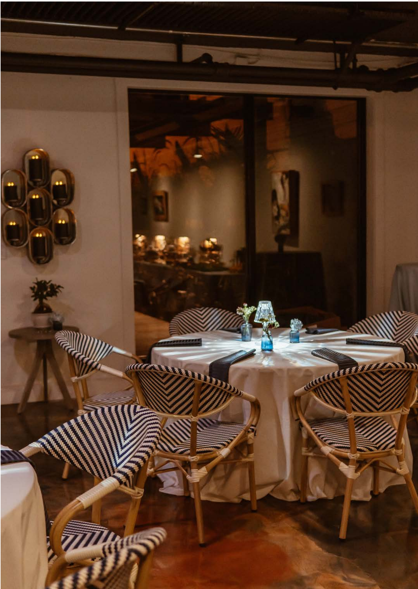
C1 - Internal use